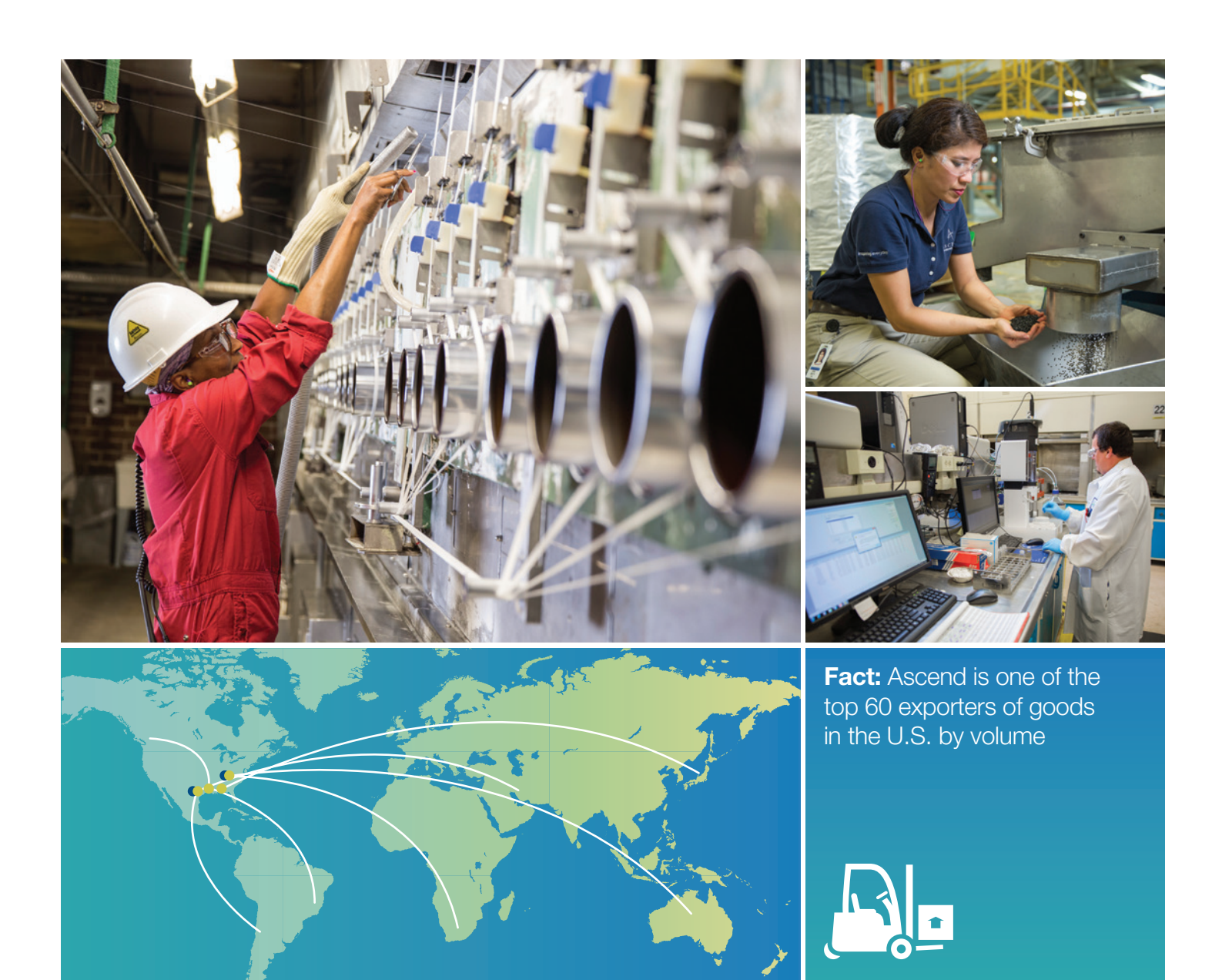
Manufacturing locations: Alvin, Texas; Decatur, Alabama; Foley, Alabama; Pensacola, Florida; Greenwood, South Carolina